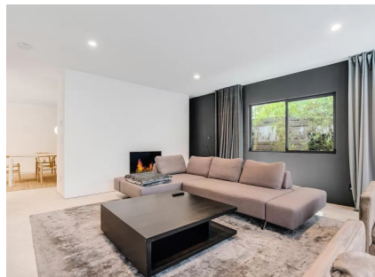
11322 MISSISSIPPI AVE 4 BEDS | 6 BATHS | 3,450 SQFT (APX) SOLD FOR $2,850,000