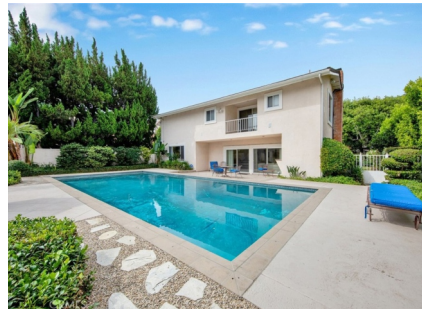
4500 HASKELL AVE 5 BEDS | 5 BATHS | 2,900 SQFT (APX) SOLD FOR $2,200,000