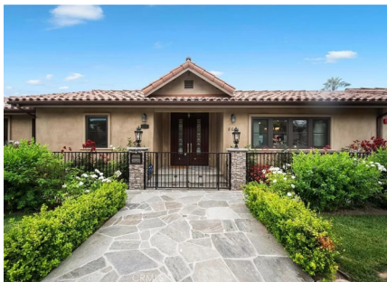
806 SERPENTINE ST 4 BEDS | 5 BATHS | 2,684 SQFT (APX) SOLD FOR $2,775,000