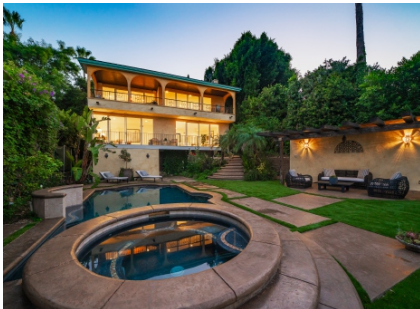
3422 LAURIE PL 4 BEDS | 3 BATHS | 2,888 SQFT (APX) SOLD FOR $2,980,000