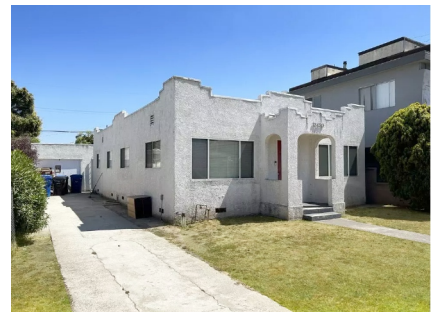
12430 SHORT AVE 4 BEDS | 2 BATHS | 1,302 SQFT (APX) SOLD FOR $1,250,000