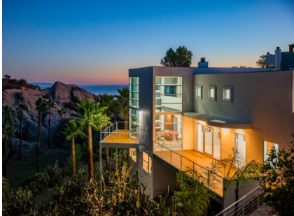
24764 W SADDLE PEAK RD 6 BEDS | 4 BATHS | 4,089 SQFT (APX) SOLD FOR $4,780,000