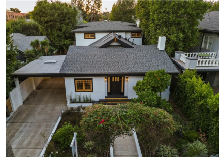
1927 N WILTON PL 4 BEDS | 4 BATHS | 3,000 SQFT (APX) LISTED FOR $3,195,000