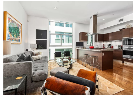
3119 VIA DOLCE APT 301 3 BEDS | 3 BATHS | 2,010 SQFT (APX) SOLD FOR $1,320,000