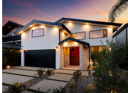
15029 VALLEYHEART DR 7 BEDS | 6 BATHS | 5,109 SQFT (APX) LISTED FOR $3,275,000